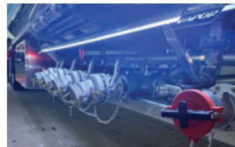
Work Area Lighting (Standard)