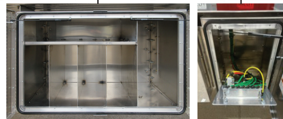
48" cabinet with shelving & accessible EVO cabinet (Standard)