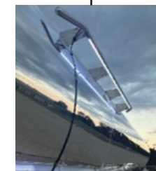
Vapor Rail Lights (Optional)