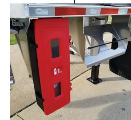
Cone & Bucket Holder Fire Extinguisher (Standard)