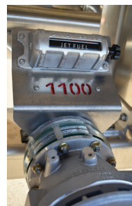
Product & Capacity Indicators (Standard)