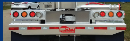
Standard Rear Ladder