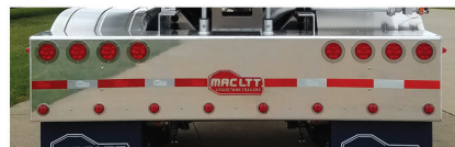
West Coast Style

MAC LTT uses premium materials and the newest technology to exceed industry standards when building our DOT 406 Tank trailer. Our DOT 406 is available in customizable capacities and axle configurations to meet various market demands. With a focus on driver safety and efficiency, we also offer a selection of custom features designed to enhance safety and streamline operations, including: