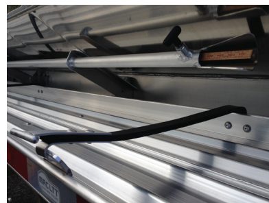
14 foot locking gauge stick and holder & 22" wide tray with hose straps (standard)