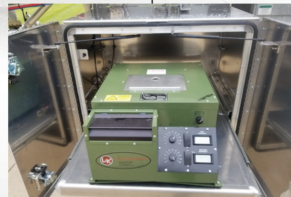
Slide-Out Centrifuge in Separate Cabinet (Optional)